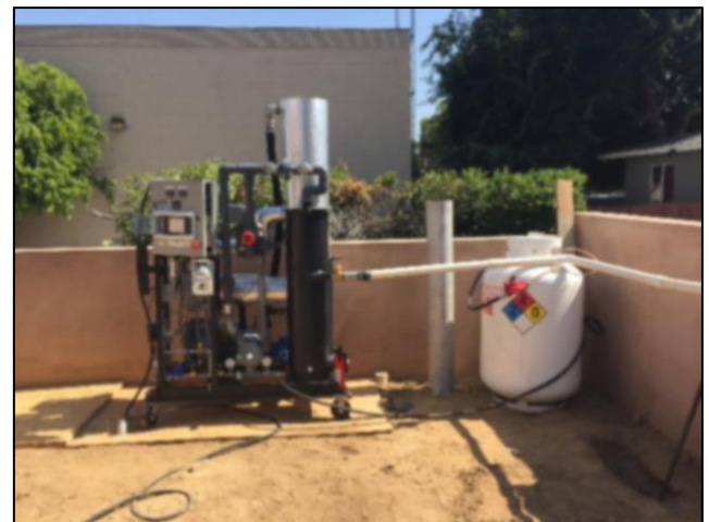
NanoTHERM RS® in the Field. Operators rolled system off their shortbed pickup, plugged in electrical cord, set up propane bottle and quick-connected to wells. Took only 2 hours! Operates in CatOx w/HE at 180 scfm, using only 18,000 btuh at 10% LEL. The filled 100 gallon Propane Tank lasted 3 weeks!

Our latest Nano-THERM RS® systems are the ultimate in small, powerful SVE extraction equipment with VOC thermal destruction included. With the entire system mounted onto a small 30" x 48" skid, our SOIL-THERM Nano-THERM RS® systems can be rolled off the back of your truck and be ready to take on the toughest sites in minutes. With a powerful 8.5 hp dual stage regenerative blower capable of 14"Hg vacuums, or a three stage regen blower for up to 20" Hg vacuum. VOCs are drawn and destroyed by the SOIL-THERM Jet-THERM® burner at flows to 250 cfm. Simple 230VAC 1-ph, 60A plug electrical with portable propane tank hookups saves thousands of dollars in fast installation & low operation costs.