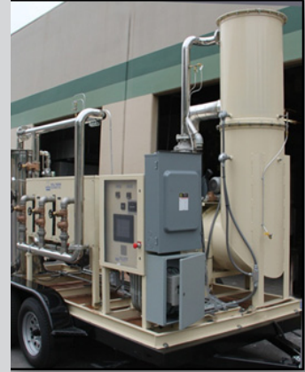
SOIL-THERM Mobile-Electric Oxidizer System

Now is the time to add ReMAC technology to your new or existing SOIL-THERM system. Our ReMAC system is guaranteed to save you time, and cut project costs! Soil-Therm can upgrade your existing system with the following equipment: cellular router with nationwide service and unlimited data access and transfer, high powered digital antenna discretely mounted to main control panel, and PLC upgrades with programming and setup information for your laptop or iPhone or iPad devices. Simple to operate, and great for sending operating snapshots of the touchscreens anywhere to operators, engineers, management and your client. This is the most advanced remote capability ever!