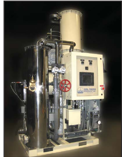
Micro-THERM XE with H.E.