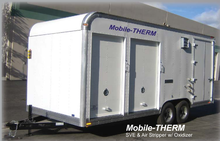
Mobile-THERM SVE & Air Stripper w/ Oxidizer