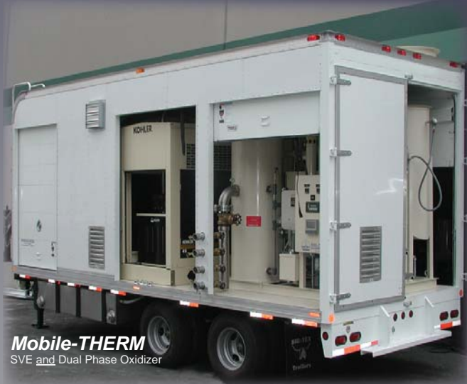
Mobile-THERM SVE and Dual Phase Oxidizer