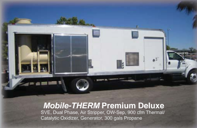
Mobile-THERM Premium Deluxe SVE, Dual Phase, Air Stripper, OW-Sep, 900 cfm Thermal/ Catalytic Oxidizer, Generator, 300 gals Propane