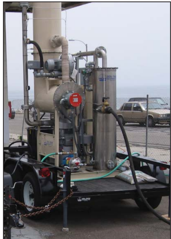
Soil-Therm Micro-ELECTRIC system with powerful Hi-Vacuum SVE Blower and Variable Frequency Drive for complete flow & vacuum range control to 14" Hg. Mounted onto a small 5'x10' dual axle trailer with room for Liquid GAC vessels.