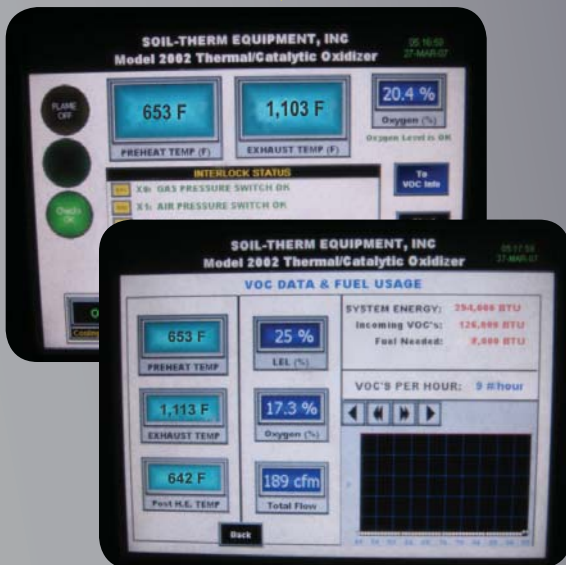
Touchscreen Controls & Datalogging (actual display varies by options selected)