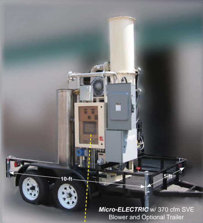
Micro-ELECTRIC w/ 370 cfm SVE Blower and Optional Trailer